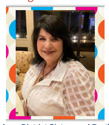
De Anza District Sisters and Brothers,

We enjoyed a wonderful September Conference. I am so thankful for all the work that our host, Hemet Woman's Club, put in to make the event successful. The venue was so cheery and bright, the food delicious and the skit was delightful. I am hoping that some of our members respond to the Hemet Libraries' Literacy Program's call for volunteers and that the Hemet teachers enjoy their survival kits and feel loved and appreciated.